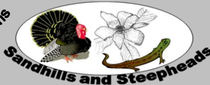
Sandhills and Steepheads