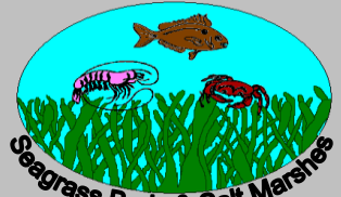
Seagrass Beds & Salt Marshes

The Sandhills and Steepheads Class covers sandhills and steephead ravines. Learn about the physiogeographic features of the region including the formation of these hills, soil makeup, and formation of the ravines. Plant and animal communities are explored along with their relationships to one another and to their environment. Be prepared to spend the morning in the classroom and the afternoon on the Bear Creek Ravine Trail. We will walk through the sandhills and down into steephead ravines. We should see many rare and unique plants and animals on this field trip. (This class does require hiking on steep terrain.)